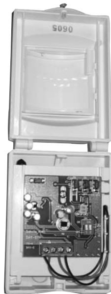
Figure 1 PIR with cover opened