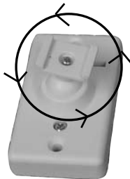
figure 6 Swivel mount